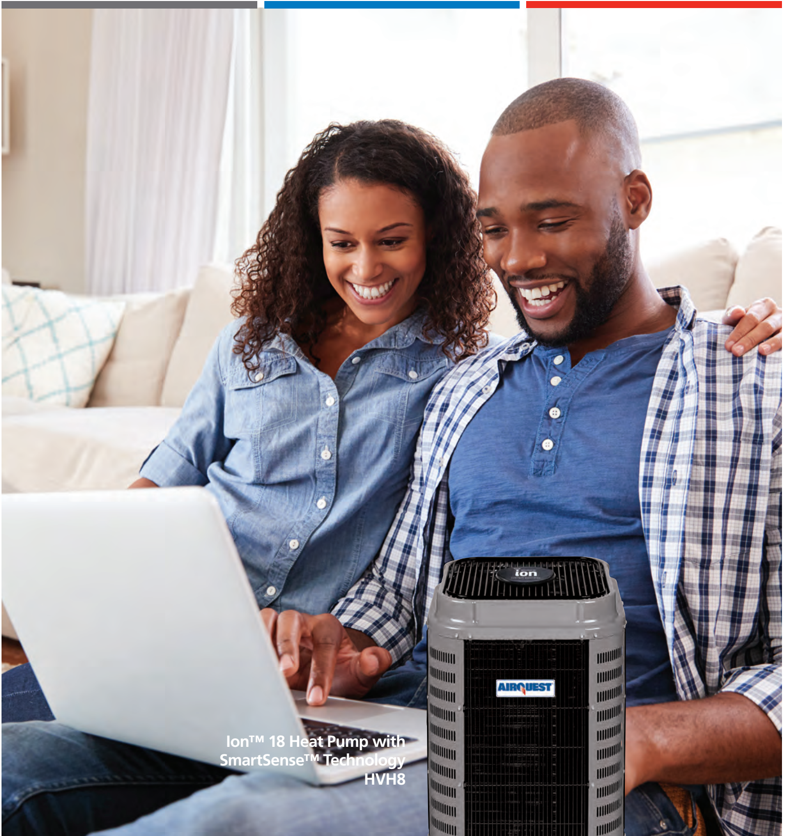
Ion™ 18 Heat Pump with SmartSense™ Technology HVH8