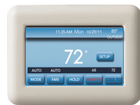
TSTAT0201CW Recommended (sold separately)

* For residential applications only. See warranty certificate for complete details and restrictions, including warranty coverage for other applications.