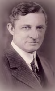
Willis H. Carrier

On July 17, Carrier employees around the world commemorated the 110th anniversary of the invention of modern air conditioning by Dr. Willis Haviland Carrier. That achievement, of course, gave rise to Carrier Corp., and eventually to Carrier Transicold, now both a part of UTC Climate, Controls & Security.