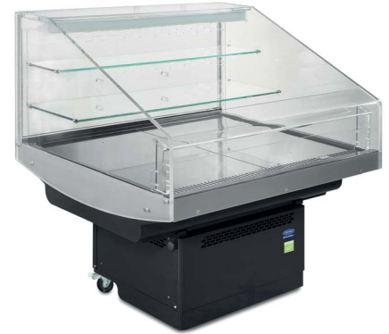
Areor ST 1230/1240