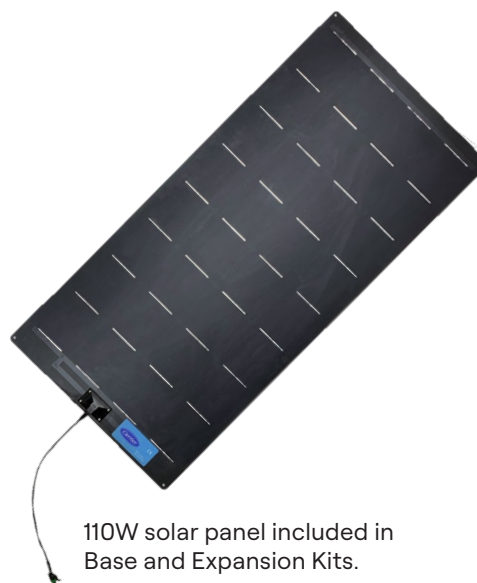
110W solar panel included in Base and Expansion Kits.