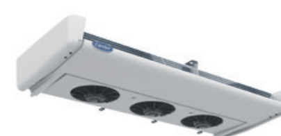
XARIOS 6 MXL 1550