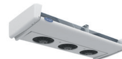
XARIOS 8 MXL 1550+