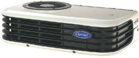
150, 200 XARIOS

For vans and medium-sized refrigerated vehicles