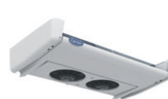
XARIOS 5 MXL 1100