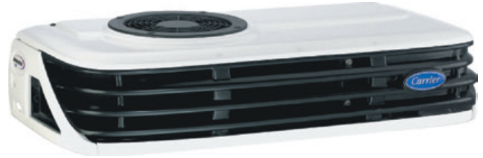
300, 350, 350MT XARIOS