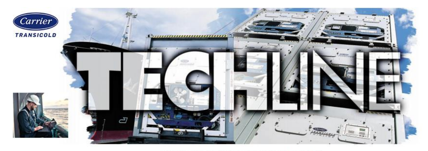
AN EXCHANGE OF TECHNICAL INFORMATION