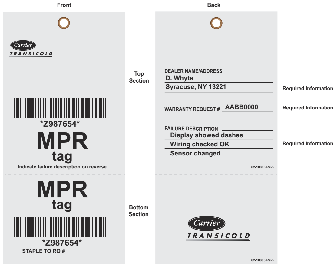
Figure 6.1 MPR Return Material Tag