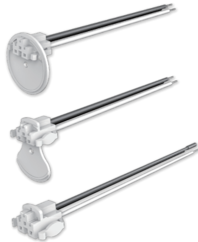
Figure 1: Legacy Kidde harnesses

After installation, turn on AC power and be sure that the AC power indicator is operating and test all your alarms following the instructions supplied by the alarm manufacturer for your specific alarm model. If the alarms are interconnected push the test button on each alarm and verify that all the interconnected alarms sound when any alarm is activated. The interconnect system should not exceed the NFPA interconnect limit of 12 smoke alarms.