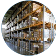
The TempTale Site wireless sensors communicate with the ColdStream Site Network Controller.