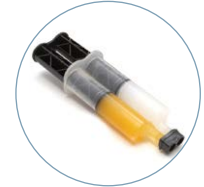
The ColdStream Site Network monitors your facility for visibility and compliance.