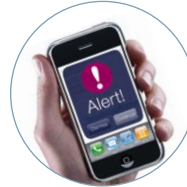
Alerts can be delivered by alarm beacon, email or text message.